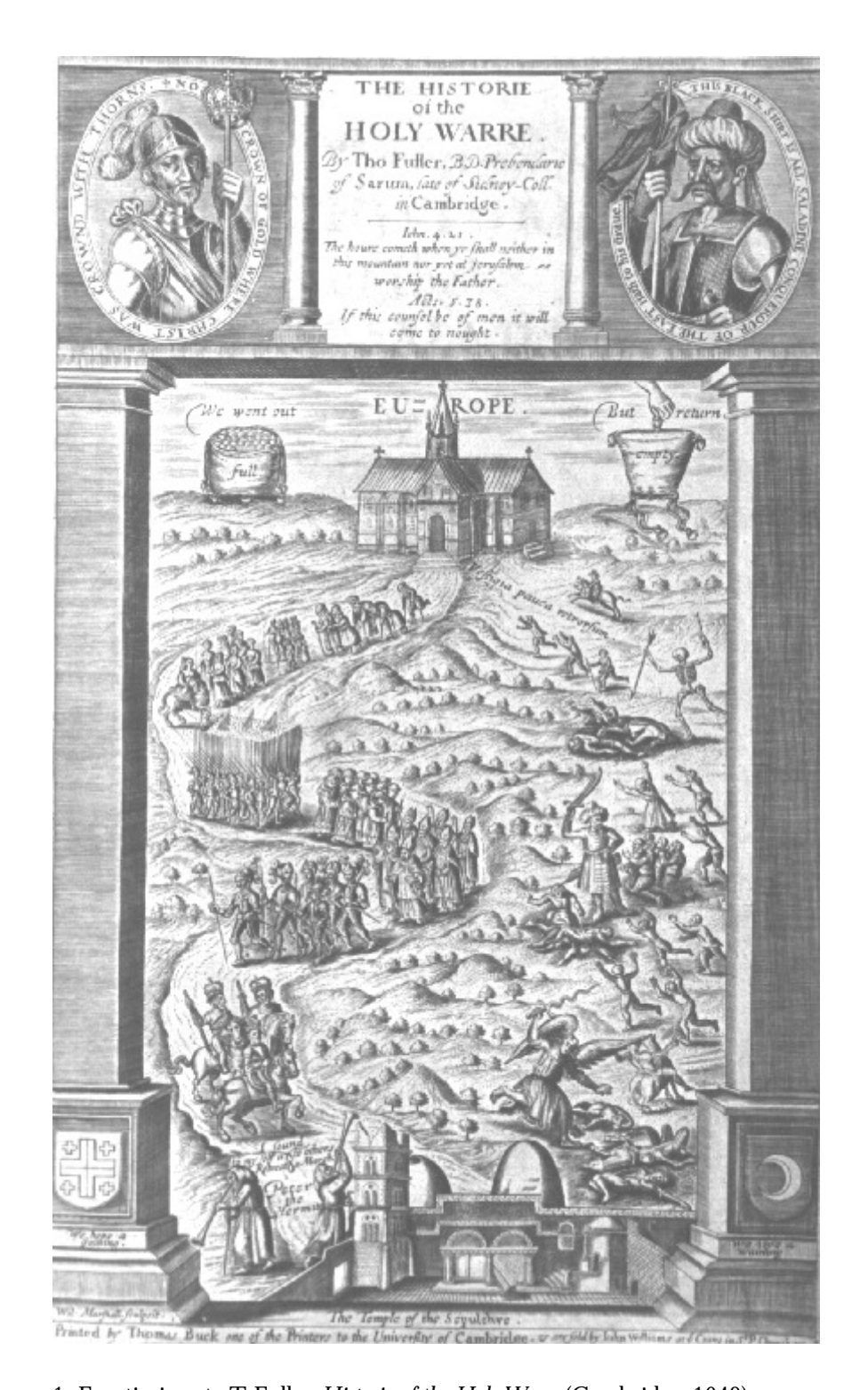
1 Frontispiece to T. Fuller, Historie of the Holy Warre (Cambridge, 1640)